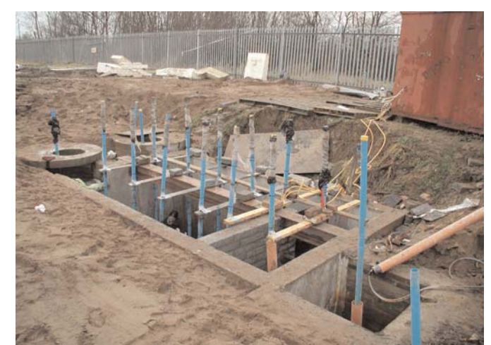
Figure 4: Field-scale biological PRB

Laboratory-scale trials are essential to determine if the process is likely to work in the field. A new Environment Agency Guidance on Laboratory Treatability Studies has been written by staff in Prof. Kalin's research group and will be published during 2005. The laboratory studies should seek to identify a number of key parameters that are likely to be good indicators for monitoring the effectiveness of the PRB when it is running in the long term; toxicity measurements were identified as convenient and useful. In addition, measurements on key organic contaminants and inorganic ions were found to be highly effective (e.g. monitoring rates of ammonium oxidation and nitrate production). TGGE analyses can provide a good comparative indication regarding the structure of the microbial population and should be periodically checked against other more rapid means to profile the population. DNA samples (DNA microarrays) could be used to give increased confidence and validation.