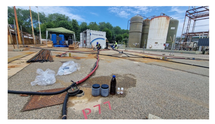
ENB pilot tests in Spain.

PWT is testing the effectiveness of the ENB technology on a pilot project in Spain. During a recent site visit, systems were checked and adjusted for monitoring physical-chemical parameters and direct current potential. The polarity of selected power electrodes was changed from anodes to cathodes and vice versa. The position of electrodes in two wells was also adjusted.