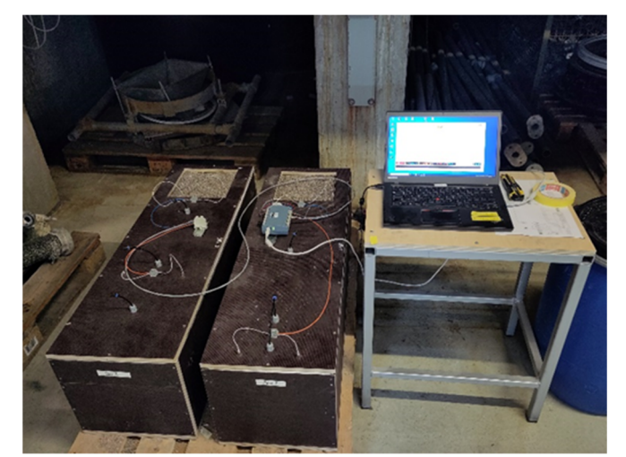
Microbial fuel cell experiments at USTUTT.

USTUTT has set up an upscaled Microbial Fuel Cell experiment to help gain insights into the development of BER technology and a field test is planned for 2024.