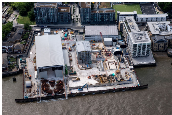
Chambers Wharf Bermondsey: location and aerial view (February 2019)