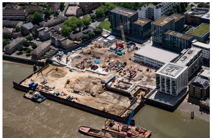
Chambers Wharf: Jetty demolition and reuse in cofferdam construction (2017).